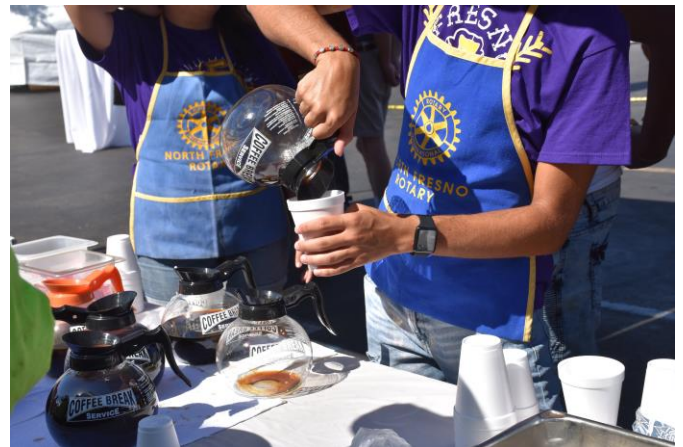
Our Annual Special Event Hosted by the Elbow Room in Fig Garden Village Shopping Center