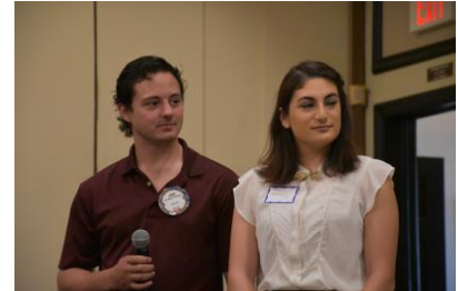
Volunteer to be a Reporter

Members of the Club and Community Avenues of Service as well as the New Members, Paul Harris, and Program Committees are particularly encouraged to apply or submit club information to share with our members and the community.