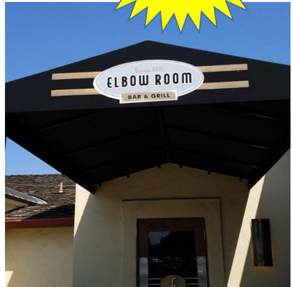
Thank You to The Elbow Room