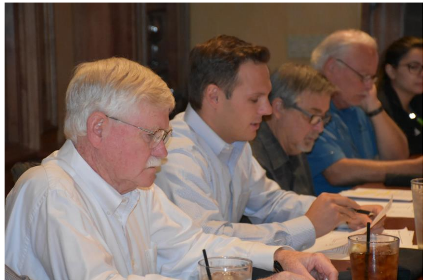
North Fresno Rotary Leaders

The Rotary Club of North Fresno is a volunteer organization whose members take action to create sustainable change in our community and around the world