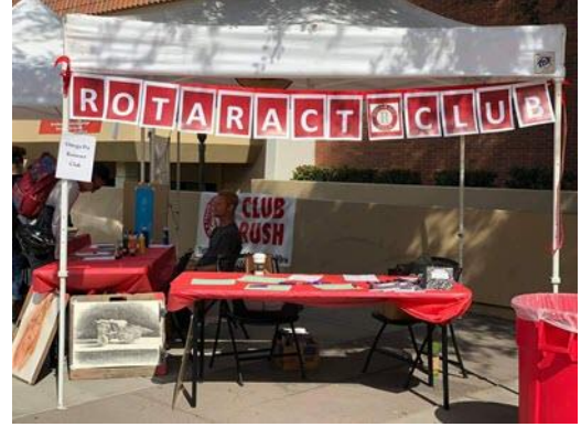
Fresno City College Rotaract Club

If you don't tell us... no one will know.