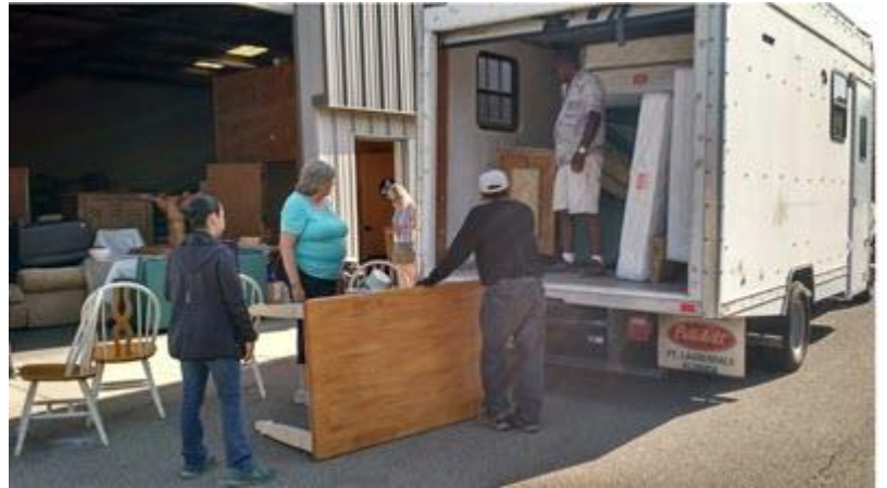
Fresno Wings Advocacy of Fresno http://www.wingsfresno.org/gallery.html