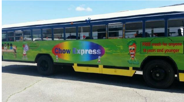
Mobile Food Vehicle

Researched based evidence indicates that children in food deserts are likely to increase their consumption of unhealthy fast food and sugar-sweetened beverages, contributing to obesity and other ailments. In 2013-2014 more than 43% of Fresno County children age 2 to 17 reported eating fast food at least twice during the past week (Packard Foundation for Children’s Health, 2014).