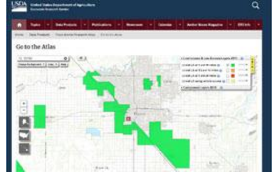
From: Fresno EOC

North Fresno Rotary and the Fresno EOC plans to provide relief for our communities. Food Deserts are neighborhoods that lack close and accessible sources of healthy food (United States Department of Agriculture Economic Research Service, 2017). In 2013 a survey of 394 Fresno County retail stores found 20.9% of stores sold four or more types of fresh fruit; just 21.2% of stores offered four or more types of fresh vegetables. Yet there were five (5) times more fast-food restaurants than supermarkets (Fresno County Department of Public Health, "Fresno County Farm to Table," 2017).