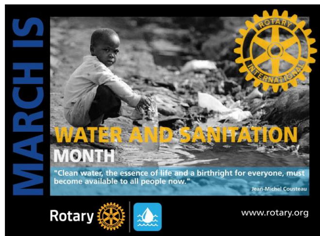
March | Water and Sanitation

The Rotary Club of North Fresno is a volunteer organization whose members take action to create sustainable change in our community and around the world