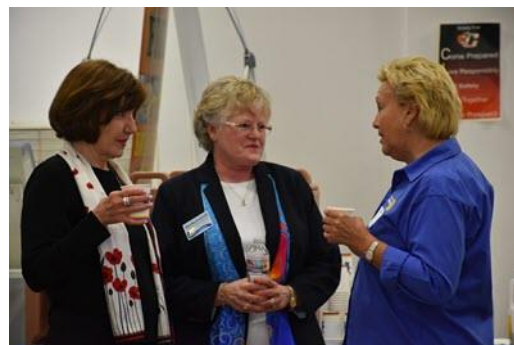
Rotary 5230 CTA 2018