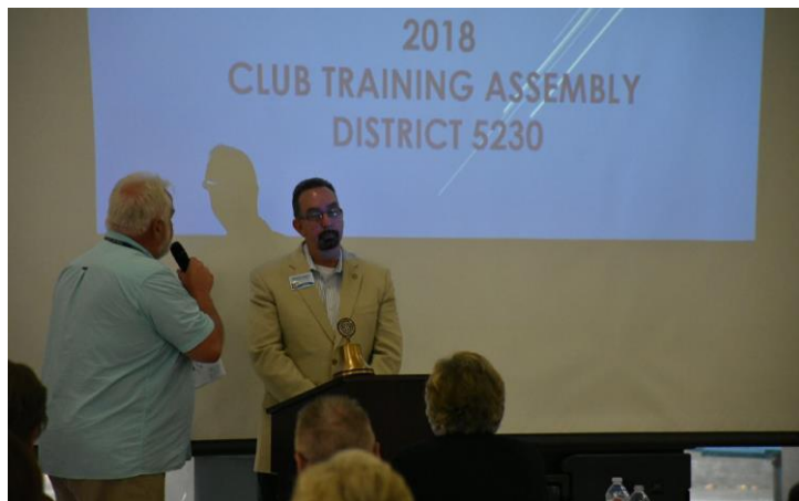
Rotary 5230 CTA 2018