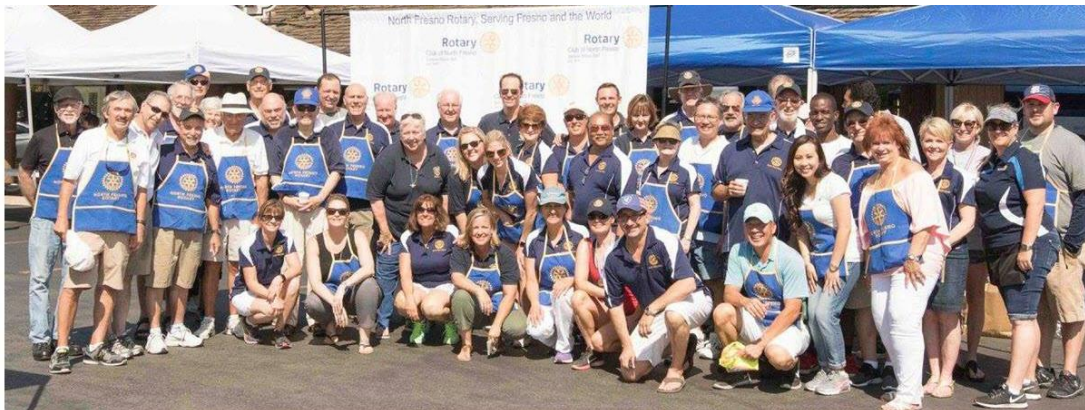
North Fresno Rotary Members

North Fresno Rotary presents our 2019 Pancake Breakfast leaders.