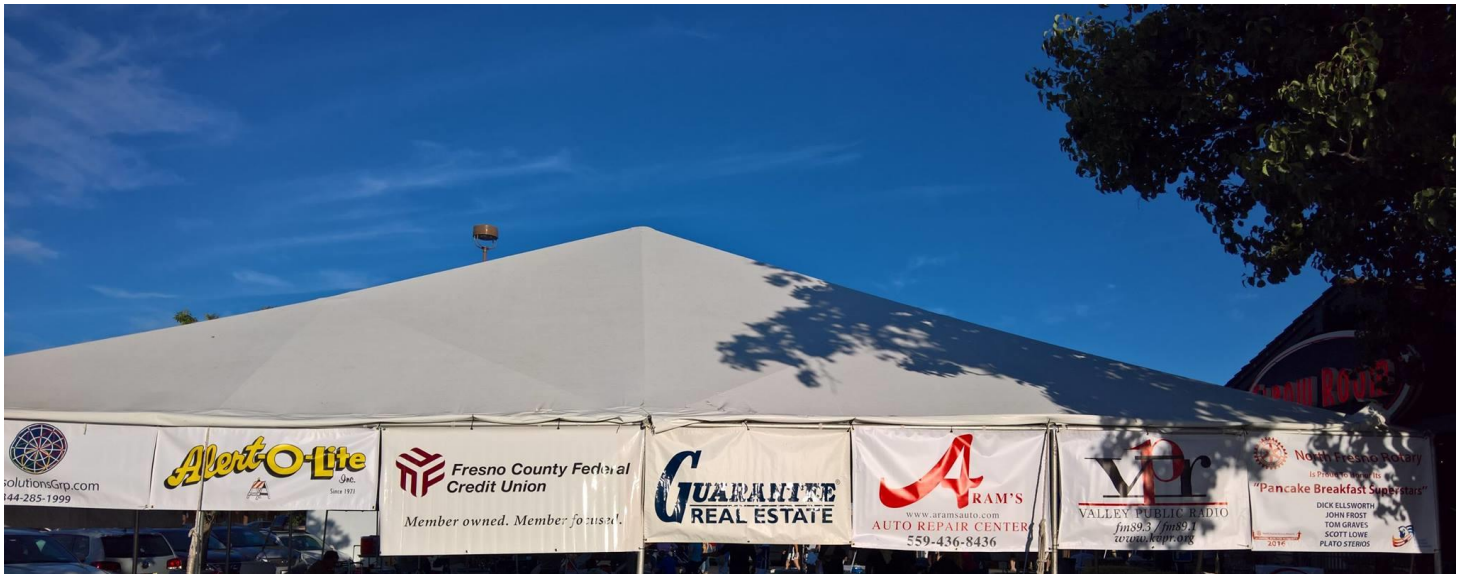
Corporate Sponsors 2015

Major Sponsors $1,000: Large banner with logo or slogan hung around the breakfast canopy, T-Shirt placement, business card on placemats, band announcements.