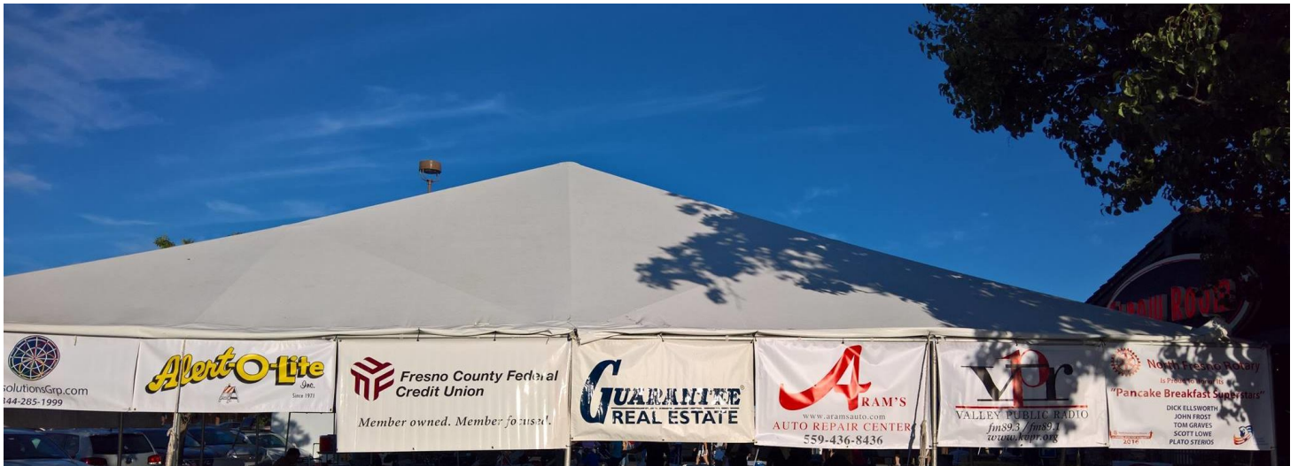
Corporate Sponsors 2015

Major Sponsors $1,000: Large banner with logo or slogan hung around the breakfast canopy, T-Shirt placement, business card on placemats, band announcements.