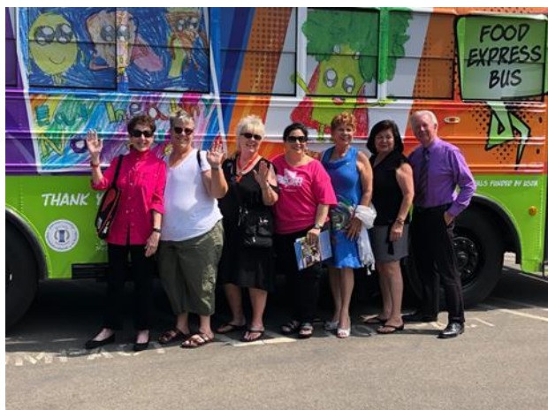
District 5230 Members