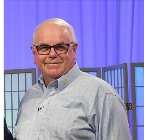
Rotary 5230 Governor Rod Coburn III

CMAC is dedicated to empowering voices in our community through media. We offer the tools and training you need to create and distribute high-quality video content that is of interest to local audiences. Our Community Media Center is located in Fresno Met building in downtown Fresno. This modern facility features a spacious 1,000 square foot production studio, private editing suites, meeting rooms, classroom space, and a computer lab, along with a variety of portable production gear. It also houses our automated broadcast center, which delivers programming to CMAC TV channels on Comcast, AT&T U-verse, and the Internet ( CMAC.tv ).