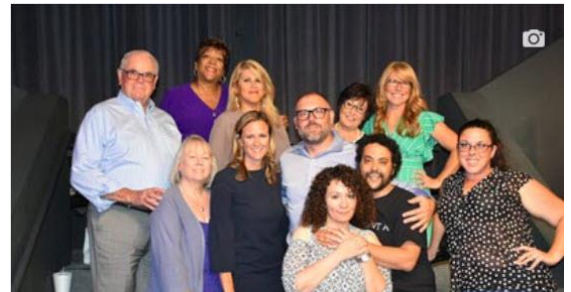
SEP 19 Rotary 5230 Governor Visit Public · Hosted by North Fresno Rotary - District 5230 Club 635 and 2 others · 1 co-host pending [?]

District 5230 rotary5230.org/ | North Fresno Rotary www.northfresnorotary.org